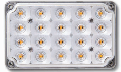
Stop/Tail/Turn and Turn